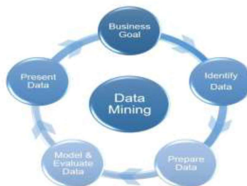
Figure 1: Data Mining [3]

These organization sectors include retail, petroleum, telecommunications, utilities, manufacturing, transportation, credit cards, insurance, banking, decision support, financial forecast, marketing policies, even medical diagnosis and many other applications, extracting the valuable data, it necessary to explore the databases completely and efficiently.